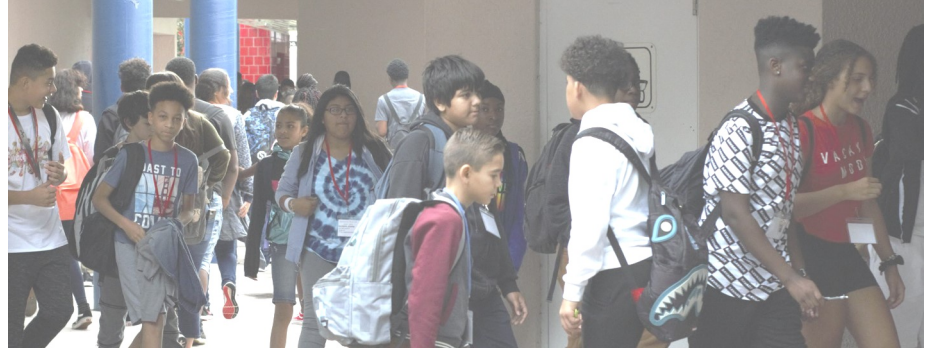
Students Return to Classes at Olsen Middle School

Repeated intentional social interaction is critical and matters greatly in the development of each child. Whether it is the book club, school dance, football game, movie night, band concert, fashion show, Breakfast with the Principal, popcorn socials, it all matters greatly in how our children interact with themselves and others and has